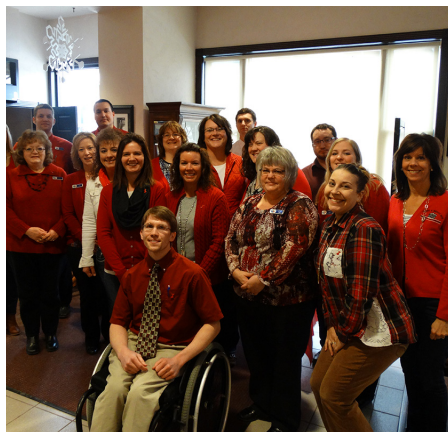
Employees show their support for the awareness of heart disease by wearing red.