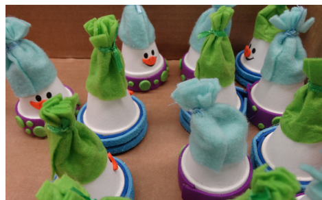
The sparkly snowman, part of a current Kindness Project, went out to over 30 residents who participate in Meals on Wheels.