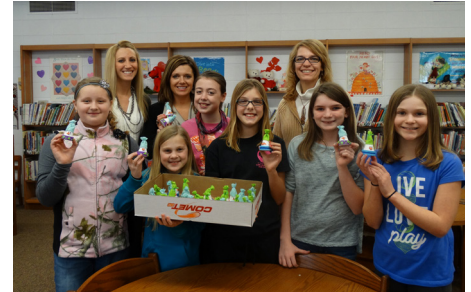
The Kindness Crew worked hard on their own lunch hour to bring a little bit of happiness to others.