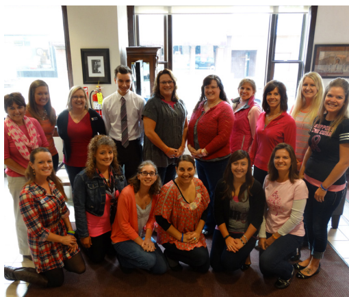
Farmers' employees wear pink to show support and raise awareness for breast cancer.