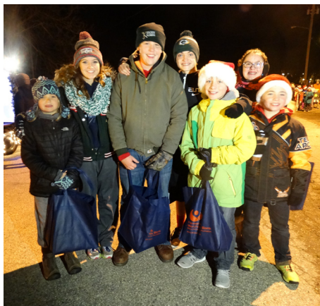
Children of Farmers' staff gather at the start of the parade with their goodie bags loaded with handouts.