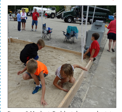
Farmers & Merchants Bank hosted a money hunt at the 2nd Annual Berlin Fox Festival in August. The BFF includes craft vendors, food vendors, kids games and live musical entertainment.