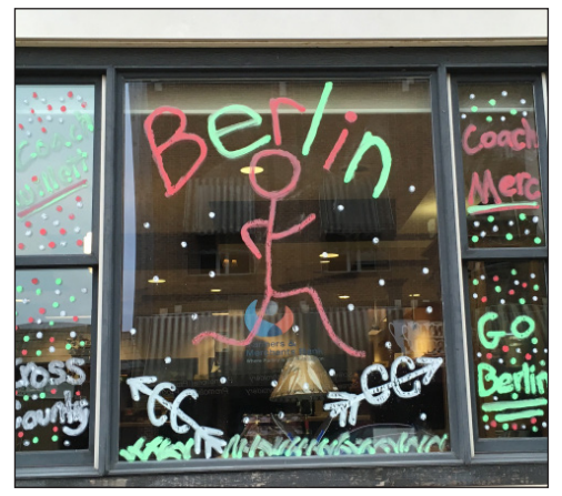
The Berlin High School Cross Country team decorated our window to celebrate their 2016 Homecoming. The Berlin Indians Football Team came away with a 21-14 victory over Winneconne.