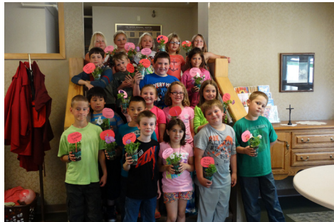
Clay Lamberton 2nd Graders, planted flowers and decorated hundreds of pots for the residents at Juliette Manor and Patriot Place.