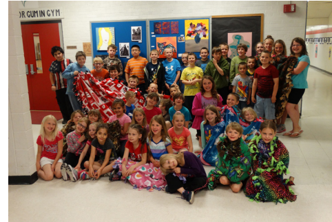
Princeton 1st and 4th graders made tie blankets and filled a basket with games and movies for two classmates, their 3 siblings and mother, who lost their father (husband) this past winter.