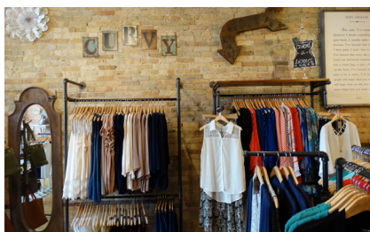
Violet & Company's Curve-a-licious line features affordable fashion in sizes XL-3XL

Violet & Company is located at 151 W Huron Street in downtown Berlin, and is open Tuesday-Friday from 10am-6pm and Saturdays, 10am-4pm.