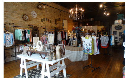
With a full line of women's clothing, jewelry and purses, Violet & Company alleviates the need to visit the mall.