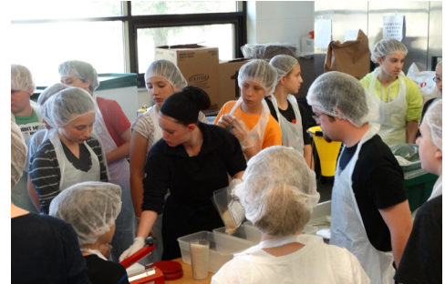
St. John's 5th-8th graders packed nine thousand meals destined for Christian refugees in Syria as part of Emmaus Mercy Meals out of Poy Sippi.