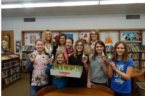
Clay Lambeton 5th Graders, crafted handmade trinkets to include in the lunches of local residents receiving Meals on Wheels. The groups goal was to bring a little bit of happiness to others.

Farmers & Merchants Bank's Kindness Project wrapped up in June and was a success for a second year straight. Providing funds and resources for four kindness acts, the Kindness Project reached hundreds of students, made a difference in people's lives both locally and worldwide, and inspired children to make a real impact in others lives. We were honored to be a part of these projects and are excited to share with you their stories.