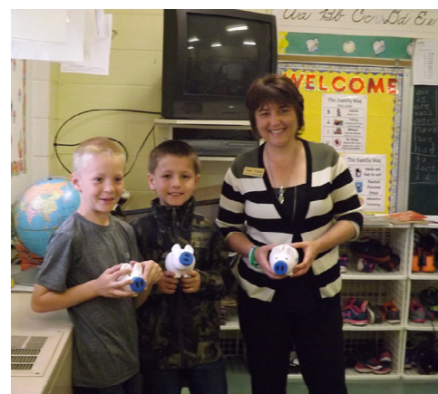
Employees stopped by All Saints Catholic School during Teach Children to Save month, and gave a short presentation on safe, and not so safe places to put your money. Each student was given a piggy bank with a little starter cash.