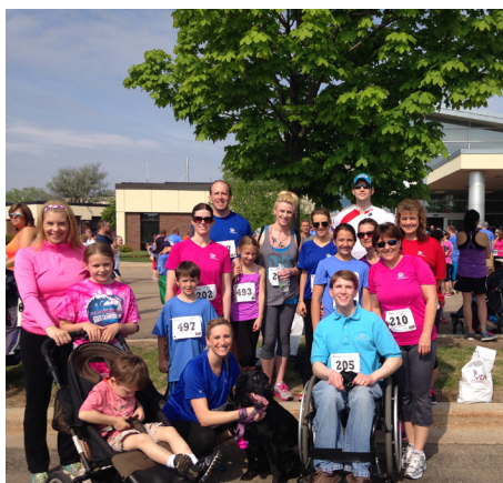
Team Farmers participated in CHN's Helping Hands for Cancer 5k run/walk in May. 100% of the proceeds benefit the Helping Hands for Cancer Fund.