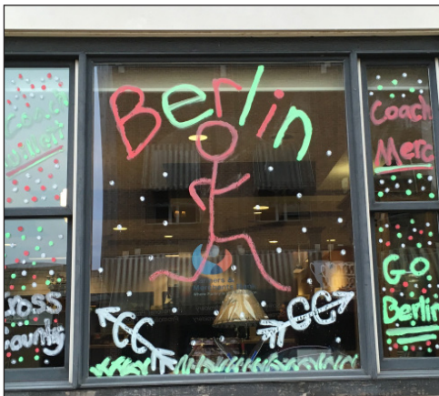
The Berlin High School Cross Country team decorated our window to celebrate their 2016 Homecoming. The Berlin Indians Football Team came away with a 21-14 victory over Winneconne.