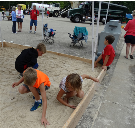
Farmers & Merchants Bank hosted a money hunt at the 2nd Annual Berlin Fox Festival in August. The BFF includes craft vendors, food vendors, kids games and live musical entertainment.